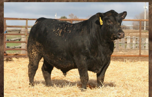
BB 8001 Black Granite 4107