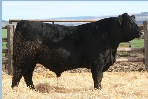
BB Coalition 5029