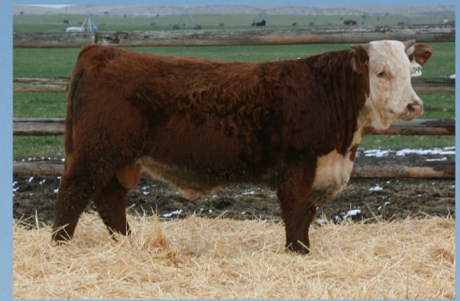
BB 3267 Domino 5044