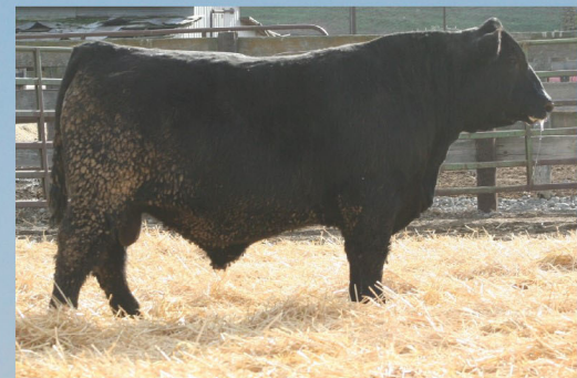
BB Pathfinder 5003