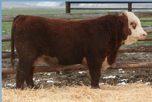
BB 8164 Domino 4142