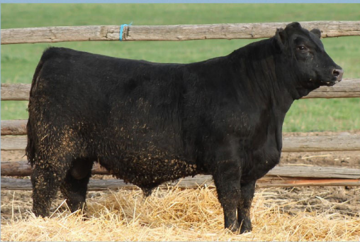
BB Pathfinder 5053